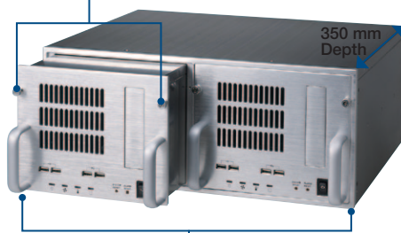
Dual Nodes Design

Thumb Screws to Fix The Sub-System in the Cage